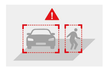
Al Perimeter Protection (Intrusion, Crossing Line Entering Area, Leaving Area)