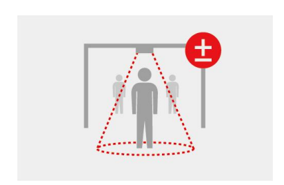
People Flow Counting