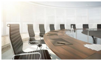
Small Meeting room