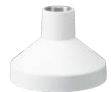
WV-QSR501F1-W Mount Bracket