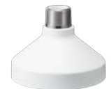
WV-QSR501M1-W Mount Bracket